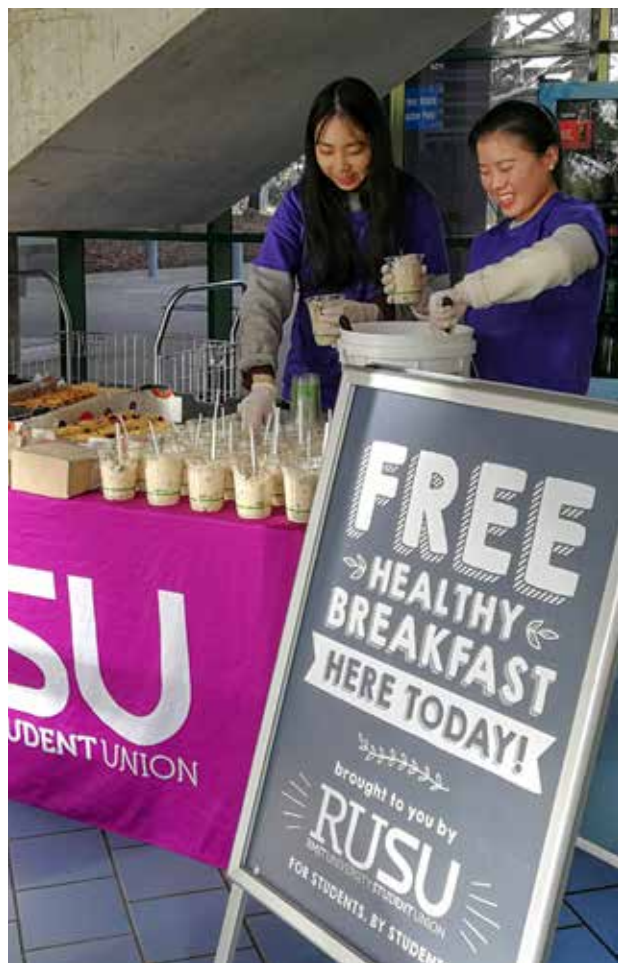
Free Healthy Breakfast