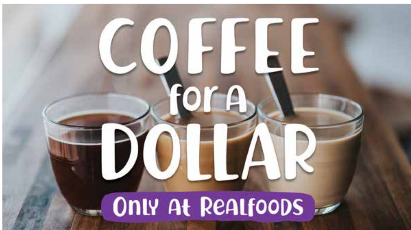
Realfoods Coffee Promotion

Realfoods participated in Sustainability Week giving 50 cents off coffees for customers bringing their keep cups.