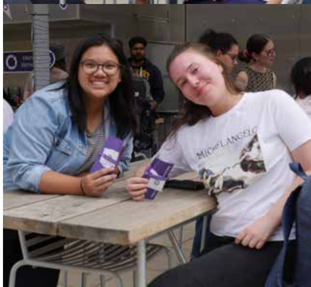
International Women's Day