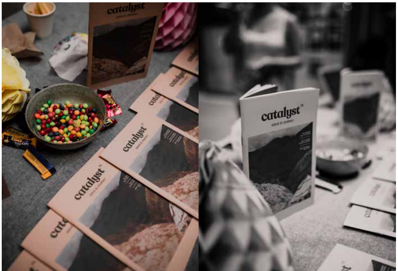
Catalyst Issue 1 2019: Journey