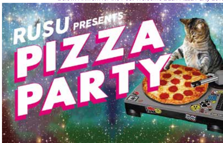
Below: Artwork for the Post-Welcome Bash Pizza Party 2019