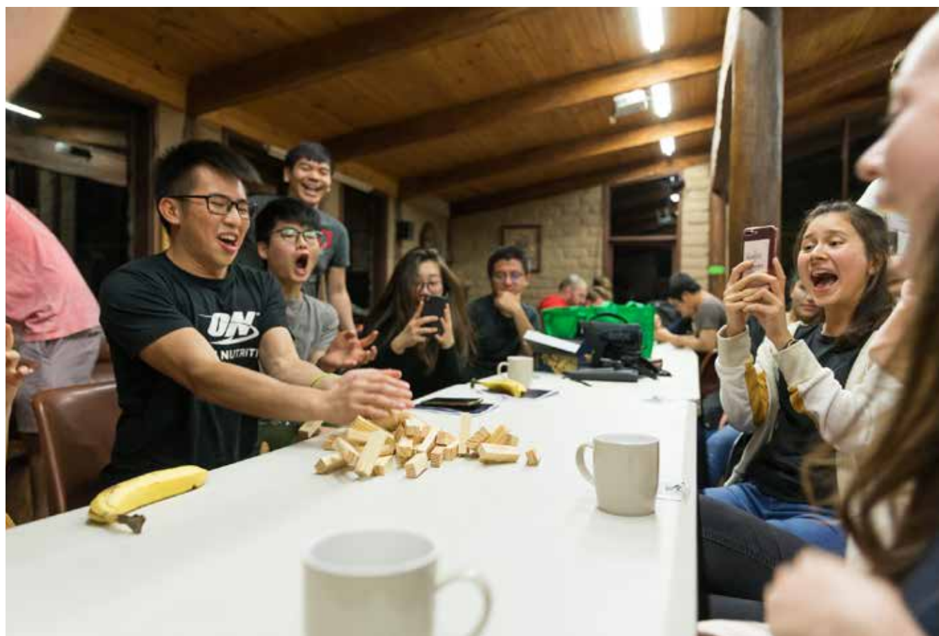
RMIT Christian Union

RMIT Liberal Club 'Pub Politics' @ Queensberry Hotel