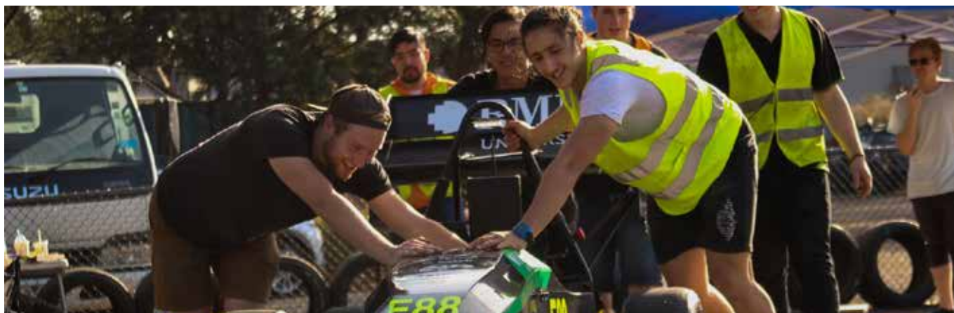
RMIT Electric Racing