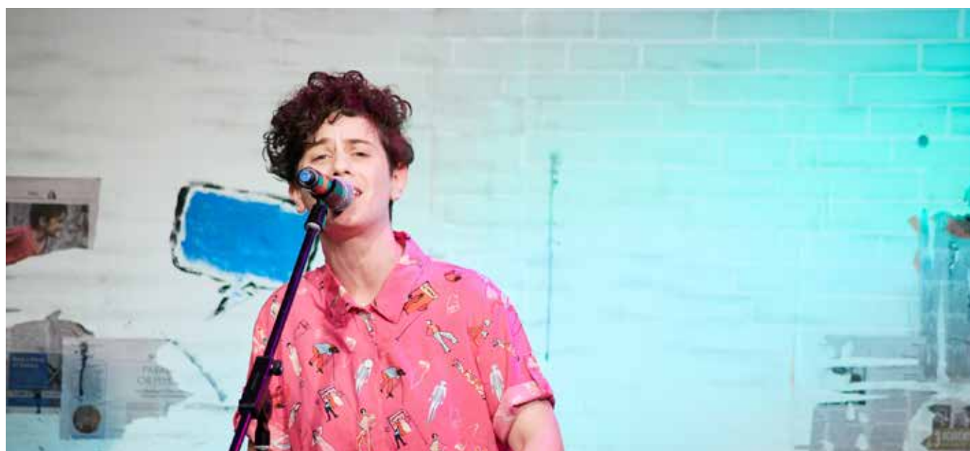
RMITV's Mainland Tonight