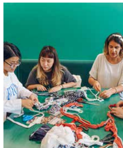
Brunswick Sustainability Workshop

In terms of casework and policy advocacy, the postgraduate team worked across City, Bundoora and Brunswick. We have provided student support, casework, and also policy observations. We have distributed merchandise and promoted our services to the student cohort. The HDR Student Rights Officer has been meeting and working with key HDR contacts across numerous schools as well as SGR.