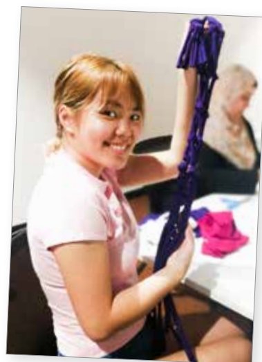
Bundoora Sustainability Workshop

The total number of workshops we ran in Quarter 1 was 12, with a further 18 remaining for Quarter 2. Twenty-one students volunteered to facilitate small group conversations and support the program facilitator. These volunteers contributed a total of 114 hours to the program in Quarter 1.