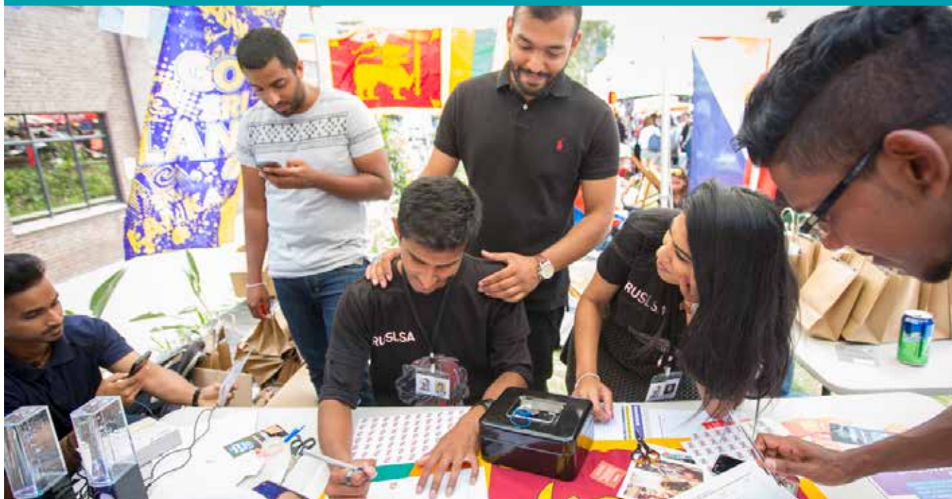
RMIT Sri Lankan Association at Clubs Welcome Day