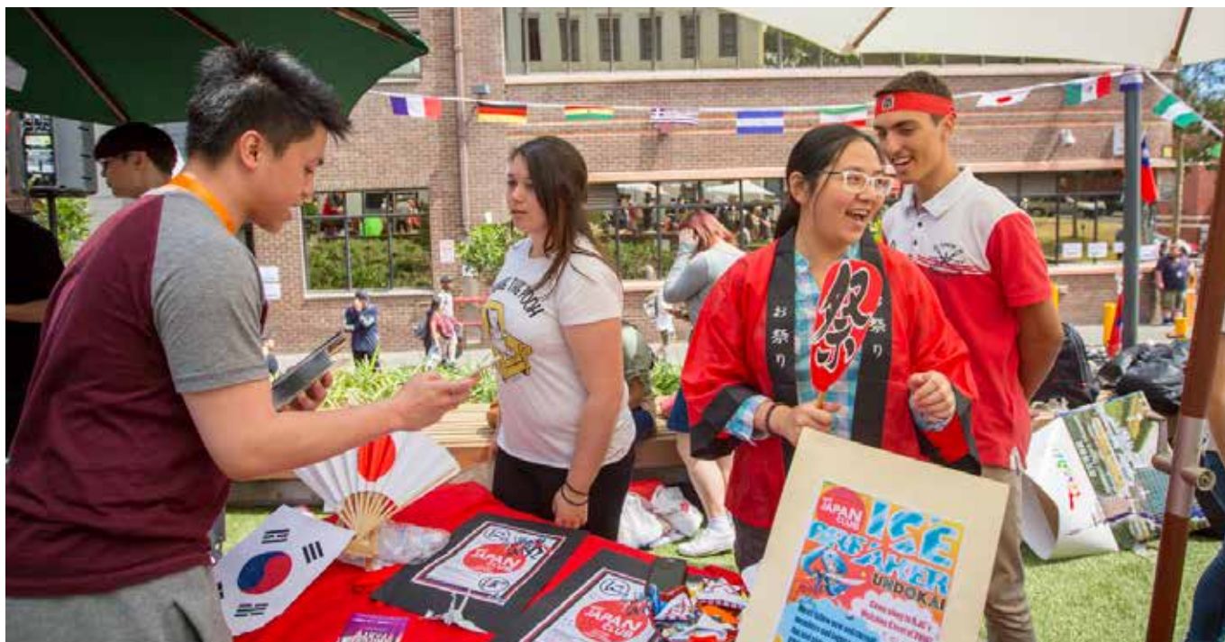
RMIT Japan Club at Clubs Welcome Day